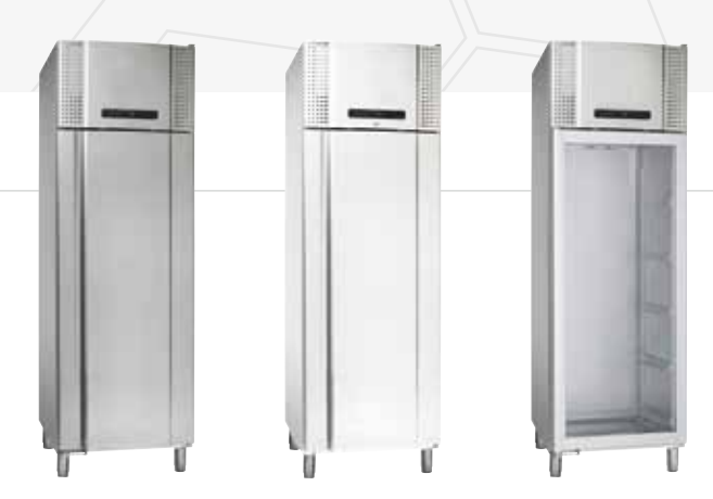
The BioBlood 600/660D is available as a refrigerator or freezer in either white or stainless steel finish. All BioBlood models come with selfclosing door. Glassdoor is available for refrigerator.

The BioBlood 600/600D cabinet utilises environmentally responsible HFC-free foam propellants and is available with HFC-free refrigerants.