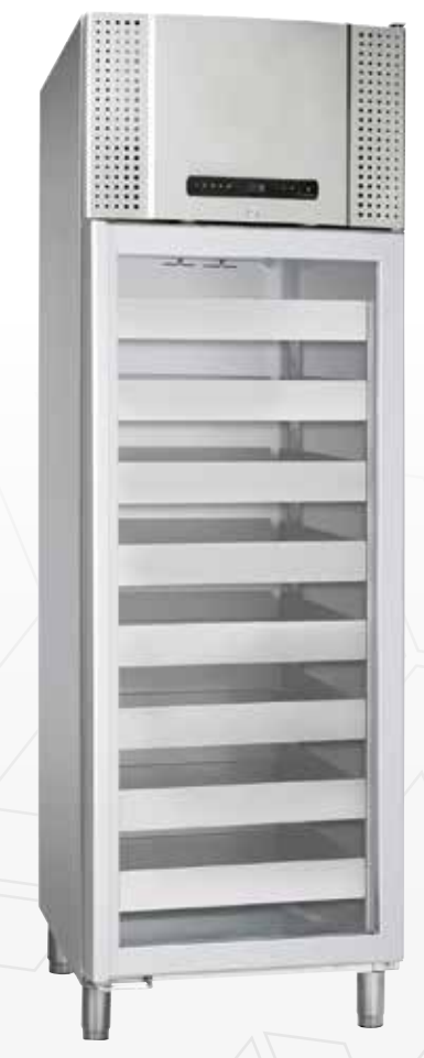
BioBlood BR660D. Drawers and glass door are optional extras.

The BioBlood 600/660 design is customised to meet the special requirements associated with the controlled storage of blood, plasma and blood-related products.