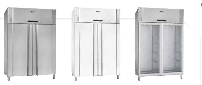
The BioPlus 1270/1400 is available as a refrigerator or freezer in either white or stainless steel finish. All BioPlus models come with self-closing door. Glass door is available for refrigerator.

In terms of performance, these units are designed to provide the very best results even under exceptional conditions. The BioPlus utilises environmentally responsible HFC-free foam propellants and is available with HFC-free refrigerants.