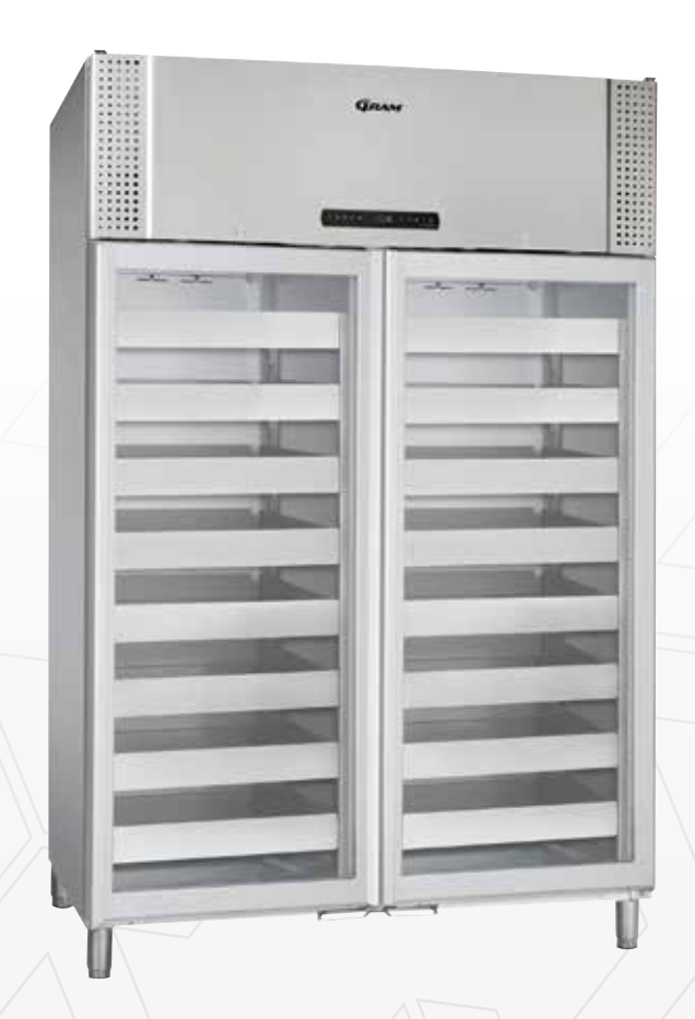
BioPlus 1400. Drawers and glass doors are optional extras.

The BioPlus 1270/1400 range is designed for the storage of the most delicate biomaterials, in situations where even tiny fluctuations in conditions inside the storage cabinet can have a serious effect on the contents.