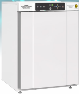
BIOBASIC RR 310 - 218 litres.