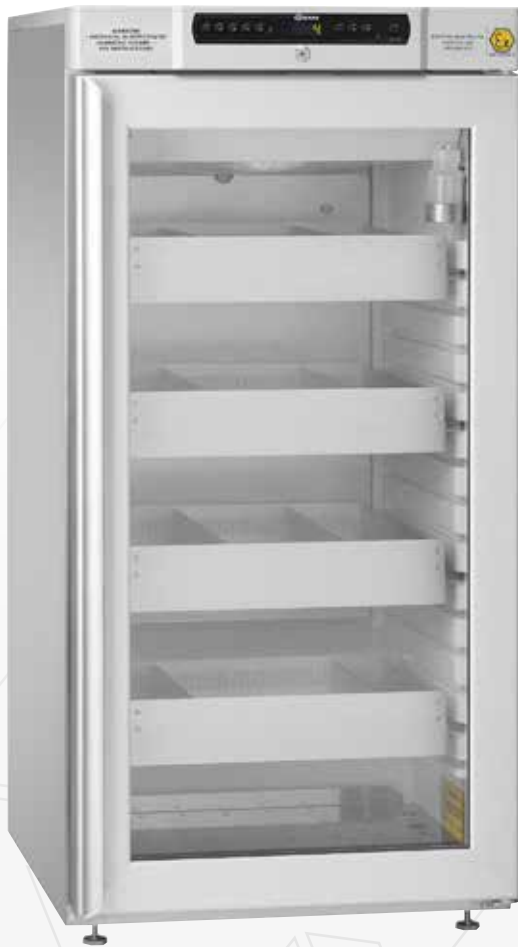
BioCompact II RR310. Drawers, reference container and glass door are optional extras.

The BioCompact II 310 is an intermediate sized refrigerator or freezer cabinet with a small footprint, designed for a wide range of biostorage purposes where the prime focus is on dependability and exceptional performance.