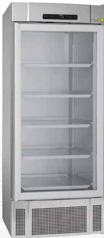
BioMidi 625. Drawers and glass door are optional extras.

The BioMidi 625 cabinet is designed to meet your biomaterial refrigeration and freezer requirements, with very few limitations.