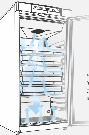
Forced air distribution in a BioCompact II cabinet with ABS drawers.

The best way to achieve this is with air flow forced in specific directions allowing cold air to reach all areas of the cabinet. This provides both temperature stability and uniformity regardless of fixtures and fittings installed in the unit.