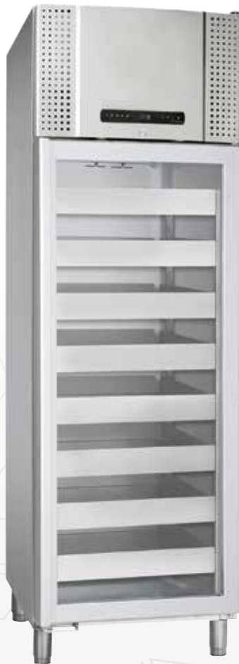
BioBlood BR660D. Drawers and glass door are optional extras.

The BioBlood 600/660 design is customised to meet the special requirements associated with the controlled storage of blood, plasma and blood-related products.