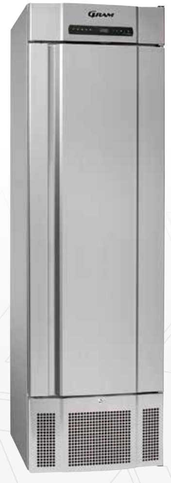
BioMidi EF425. Drawers are optional extras.

The BioMidi EF425 cabinet is a low temperature freezer that operates in the temperature range -5/-40 °C. It is a high capacity ventilated refrigeration unit that makes sure the interior quickly returns to the specified temperature after the door has been opened.