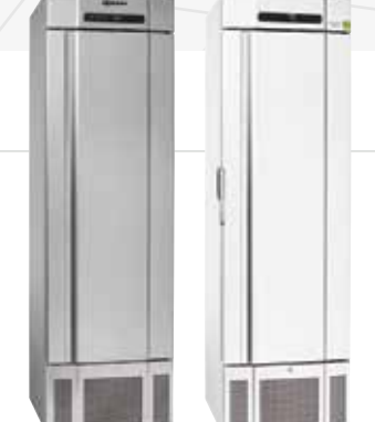
The BioMidi EF425 is available in either white or stainless steel finish. All models come with selfclosing door.

The functional design ensures easy, ergonomically correct access to the storage space.