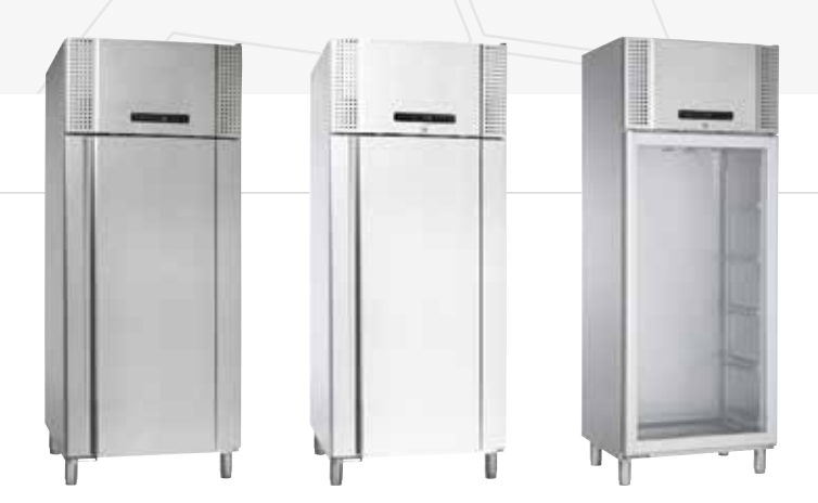
The BioPlus 600/660W is available as a refrigerator or freezer in either white or stainless steel finish. All BioPlus models come with self-closing door. Glass door is available for refrigerators.

In terms of performance, these units are designed to provide the very best results even under exceptional conditions. The BioPlus utilises environmentally responsible HFC-free foam propellants and is available with HFC-free refrigerants.