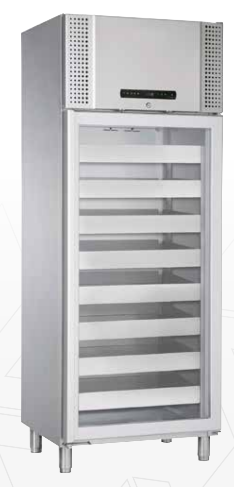
BioPlus 600/660W. Drawers and glass door are optional extras. (Glass door for ER only).

The BioPlus 600/660W range is designed for the storage of the most delicate biomaterials, in situations where even tiny fluctuations in conditions inside the storage cabinet can have a serious effect on the contents.