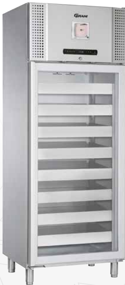
BioBlood BR660W Drawers and chart recorder are optional extras.

The BioBlood 600/660W design is customised to meet the special requirements associated with the controlled storage of blood, plasma and blood-related products.