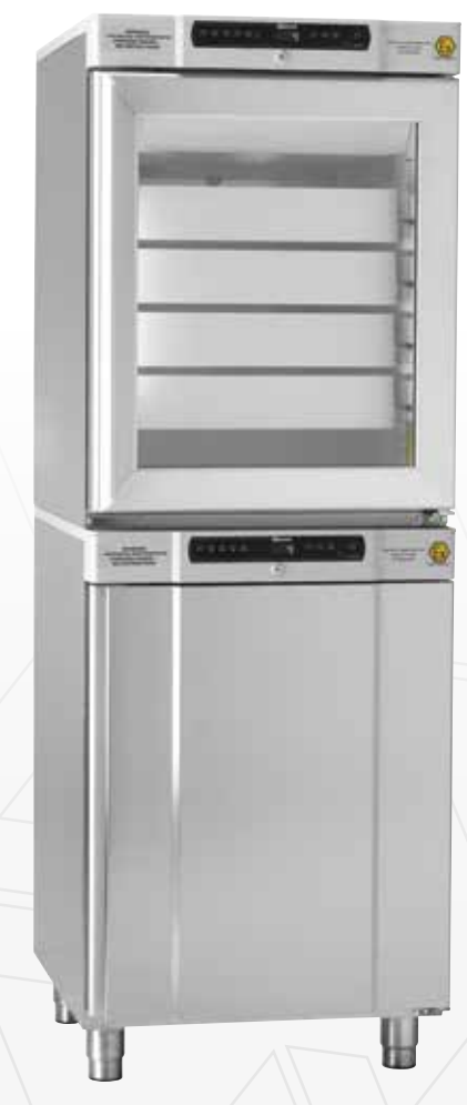
BioCompact II RR210/RF210 Drawers and glass door are optional extras.

The BioCompact II 210/210 is a combination refrigerator and/or freezer cabinet with a small footprint, designed for a wide range of biostorage purposes where the prime focus is on dependability and exceptional performance.