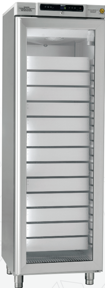
BioCompact II RR410. Drawers, glass door and reference container are optional extras.

The BioCompact II 410 is a large refrigerator or freezer cabinet with a small footprint, designed for a wide range of biostorage purposes where the prime focus is on dependability and exceptional performance.