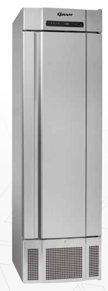
BioBlood PF425. Drawers are optional extras.

The BioBlood PF425 cabinet is a low temperature plasma freezer that operates in the temperature range -5/-40°C. It is a high-capacity ventilated refrigeration unit that makes sure the interior quickly returns to the specified temperature after the door has been opened.