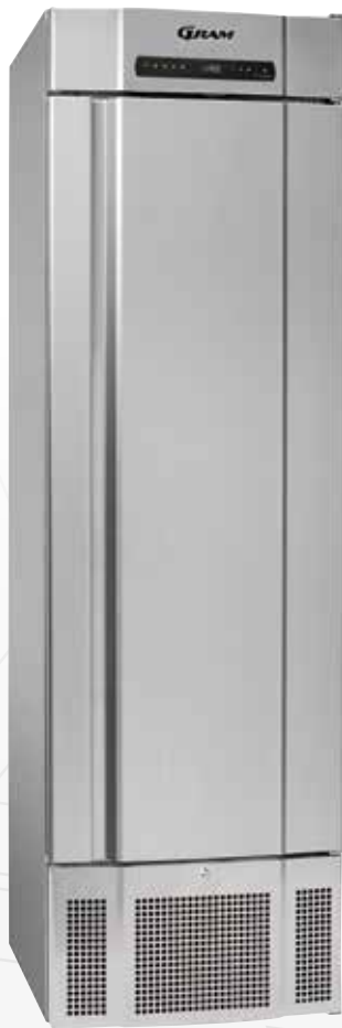
BioBlood PF425. Drawers are optional extras.

The BioBlood PF425 cabinet is a low temperature plasma freezer that operates in the temperature range -5/-40^{\circ}\text{C} . It is a high-capacity ventilated refrigeration unit that makes sure the interior quickly returns to the specified temperature after the door has been opened.