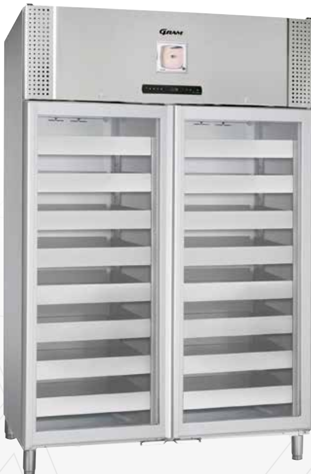
BioBlood BR1400. Drawers and chart recorder are optional extras.

The BioBlood 1270/1400 design is customised to meet the special requirements associated with the controlled storage of blood, plasma and blood-related products.