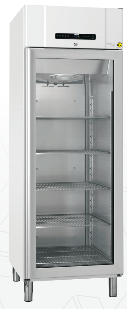
Shelves and glass door and foot pedal are optional extras.

The BioCompact II 610 is a range of economical, environmentally responsible refrigerators and freezers designed specifically for biostorage uses.