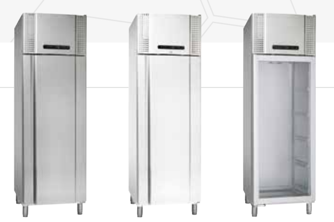
BioPlus 660D Drawers and glass door are optional extras.

The BioPlus 600/660D is available as a refrigerator or freezer in either white or stainless steel finish. All BioPlus models come with self-closing door. Glass door is available for refrigerator.