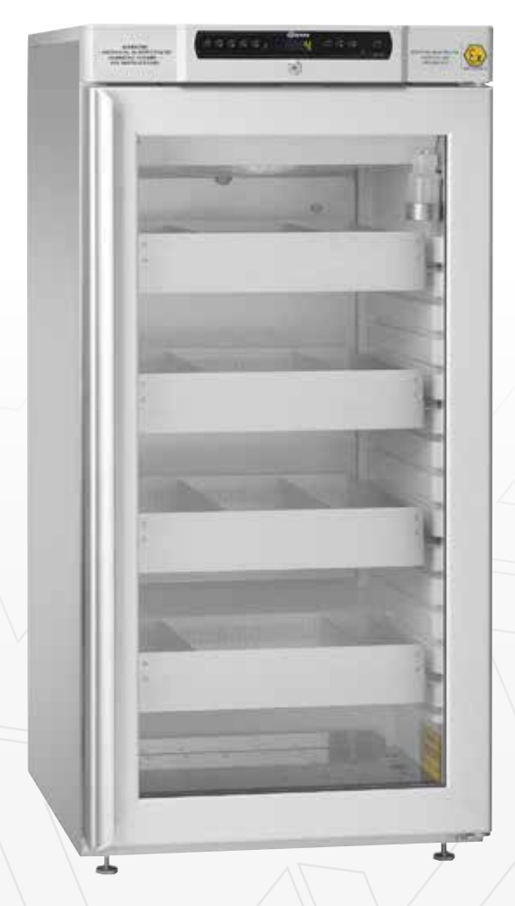
BioCompact II RR310. Drawers, reference container and glass door are optional extras.

The BioCompact II 310 is an intermediate sized refrigerator or freezer cabinet with a small footprint, designed for a wide range of biostorage purposes where the prime focus is on dependability and exceptional performance.