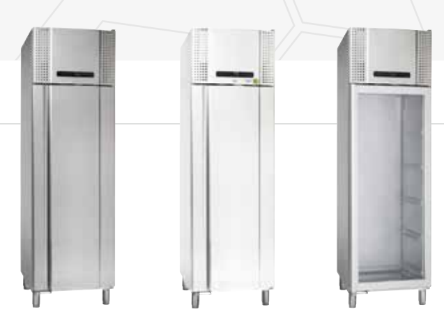
The BioPlus 500 is available as a refrigerator or freezer in either white or stainless steel finish. All BioPlus models come with self-closing door. Glass door is available for refrigerator.

In terms of performance, these units are designed to provide the very best results even under exceptional conditions. The BioPlus utilises environmentally responsible HFC-free foam propellants and is available with HFC-free refrigerants.