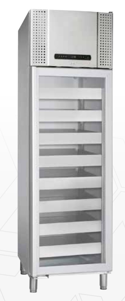
BioPlus 500. Drawers and glass door are optional extras.

The BioPlus 500 range is designed for the storage of the most delicate biomaterials, in situations where even tiny fluctuations in conditions inside the storage cabinet can have a serious effect on the contents.